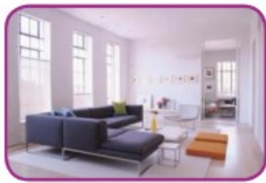
living room /living rum/ /fernicha/