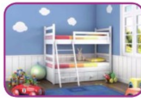
bedroom /bed rum/