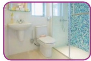
bathroom /baz rum/